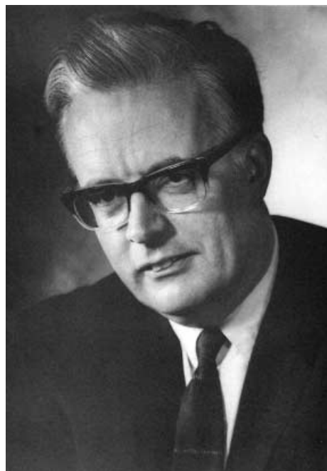
Sir David Cox during his presidency of the Royal Statistical Society

If we are ever to see the science of statistics taken as seriously as it should be, not only must those who need statistics, and those who need statisticians, understand its value, but so must statisticians themselves. By way of example, Cox tells the following story: "We had a visitor years ago, a very famous decision-theory-oriented statistician, and he had to decide what accommodation to choose from what he was offered. Somebody said to him, well, you are an expert on decision theory; does not that help, and he said something like: 'Oh, I don't use decision theory on anything as important as where I'm going to live!' I don't think he was joking either..."