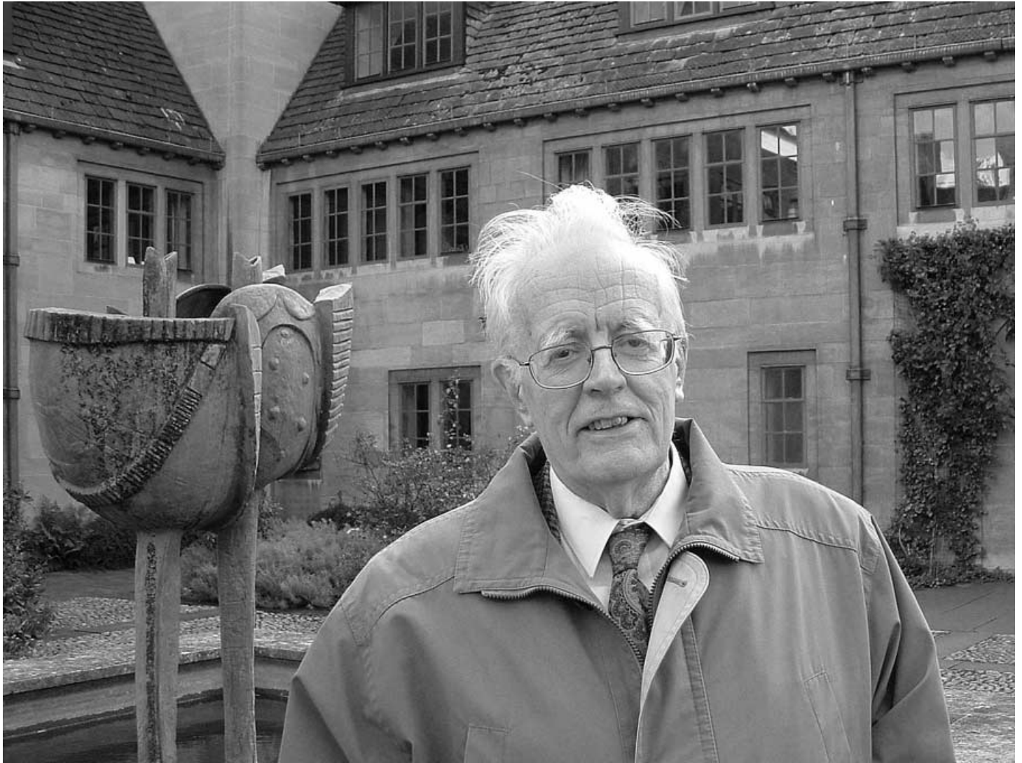
Sir David Cox at Nuffield College, Oxford

partly. There is the mixture of theory and application, and so many different fields of application." He points out that one of the most interesting aspects of the study of statistics is the possibility of switching between theory and application, and also of switching between radically different spheres of application, with relative ease. "With statistics, many people, as they get older, become relatively more interested in applications than theory. I started in applications, and then became more interested in theory, and then became more interested in applications, although I don't separate the two, really."